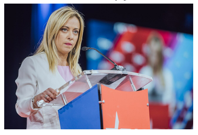
Gay City News