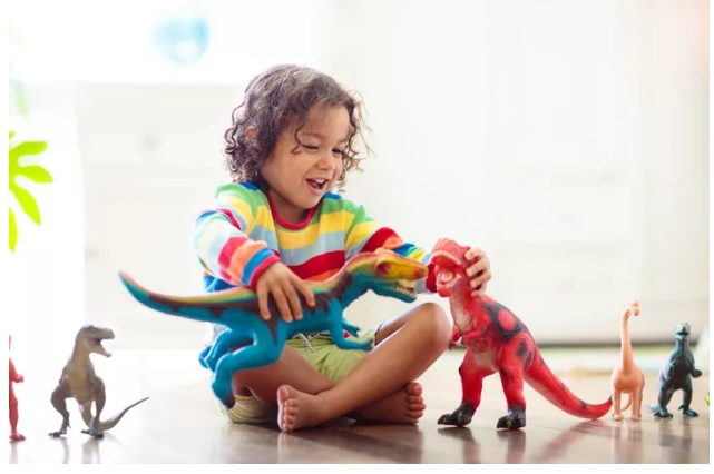
New York Family